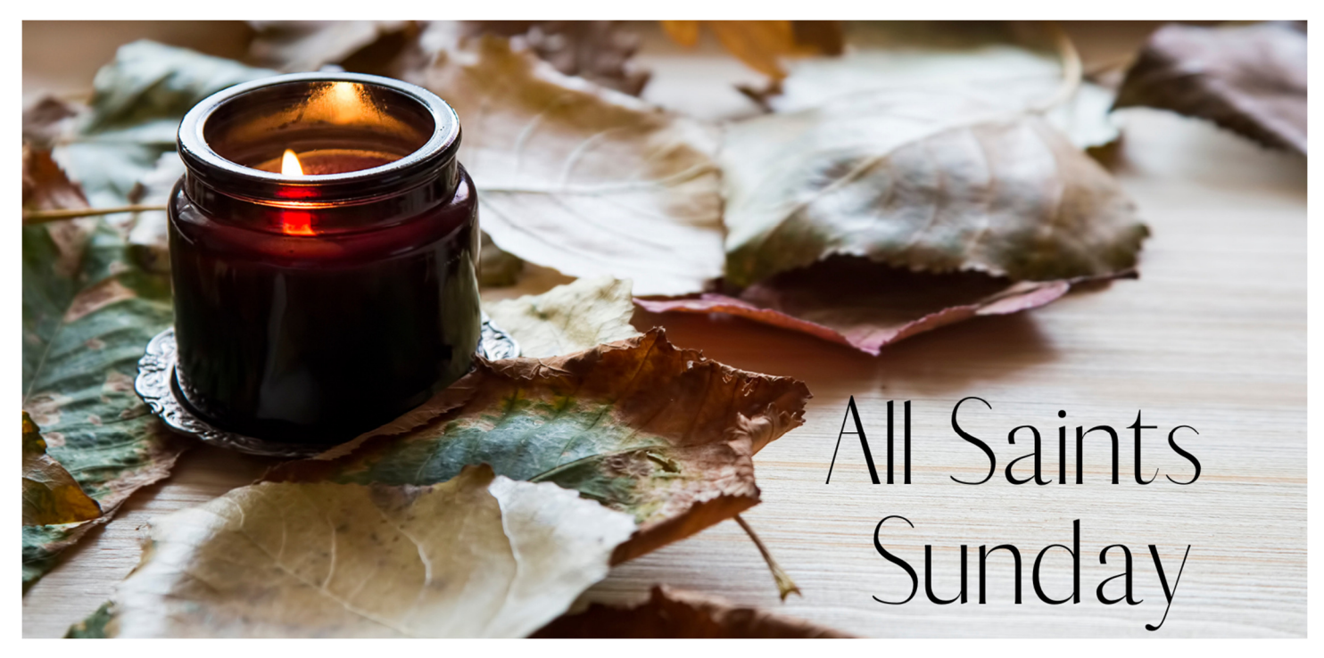
Heritage United Methodist Church Worship November 6, 2022